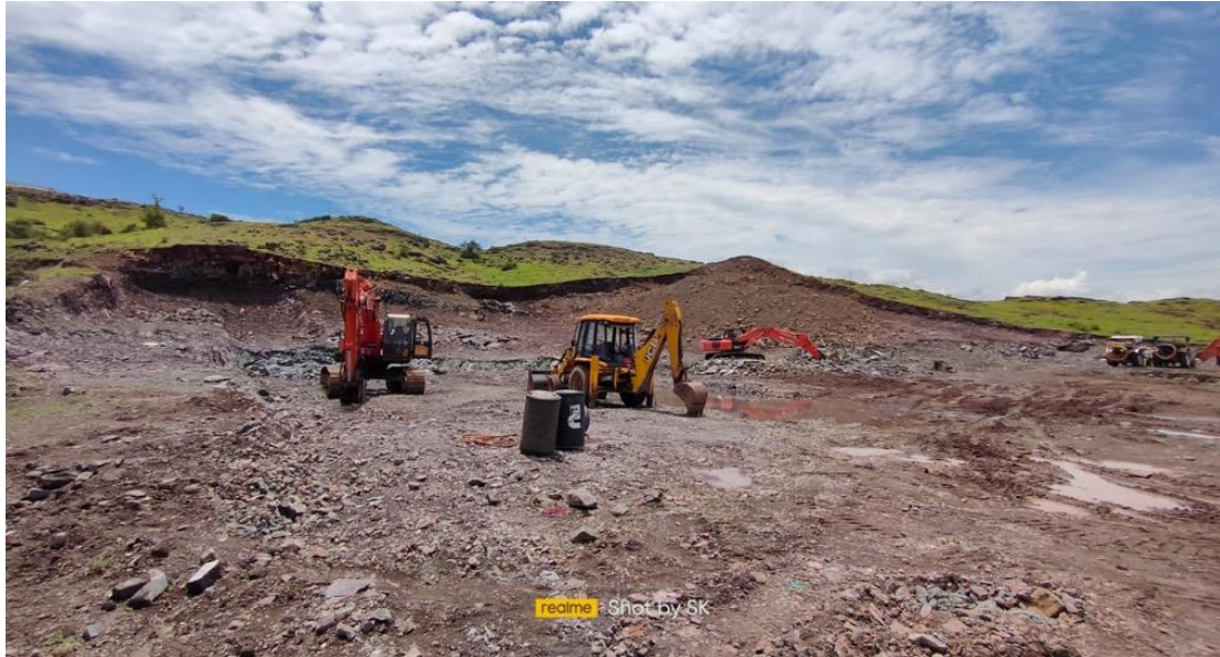
May 7 th 2022