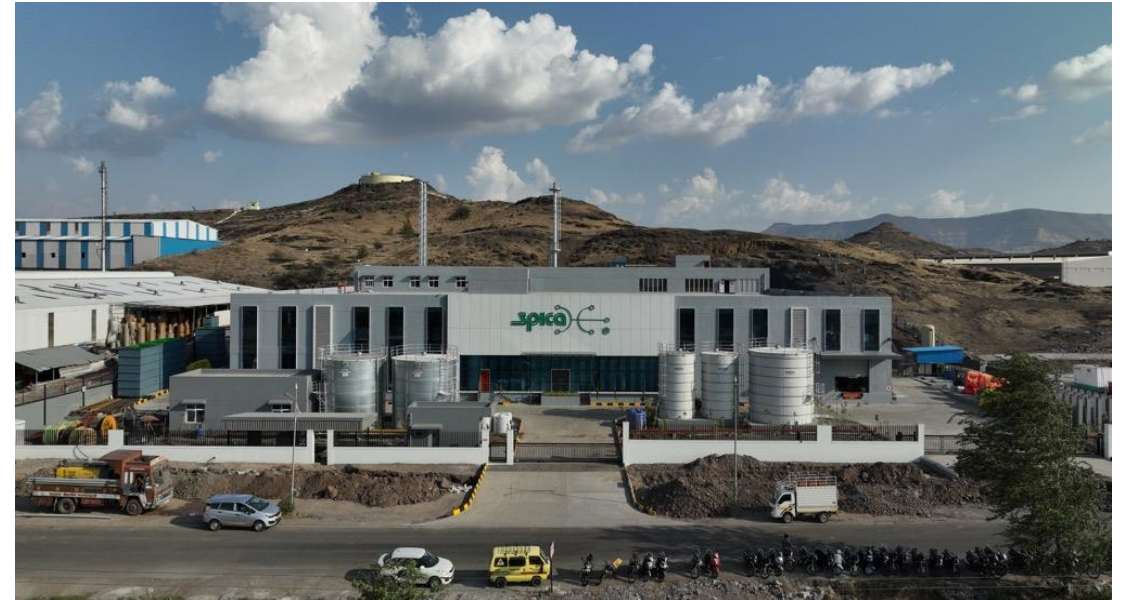
May 7 th 2023